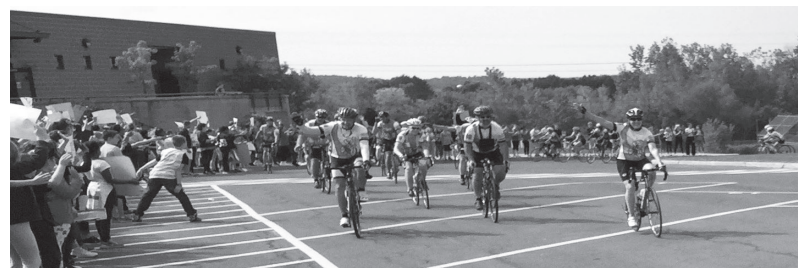
The riders coming onto campus