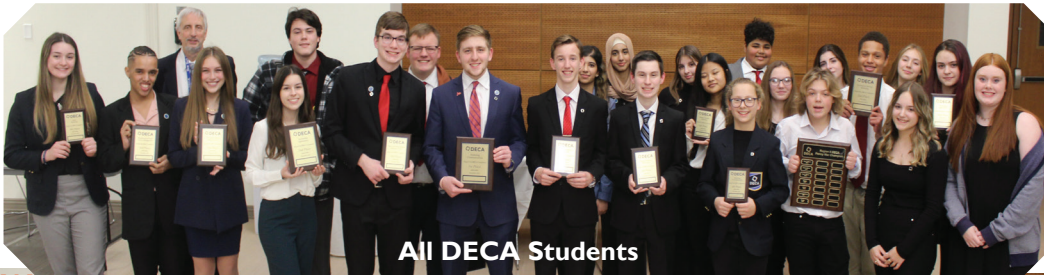
All DECA Students

Congratulations to all of these students and good luck as they move forward in the competition.