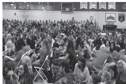
Pictured are Solvay students at Teen Book Festival. Nearly 70 students attended.