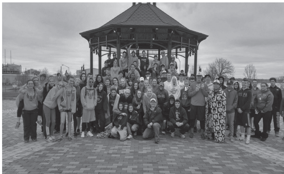
Athletes at Highway Cleanup

This spring, the stadium area and Hazard Street fields will be under repair. Please check our Twitter page to see the most up to-date pictures and status reports.