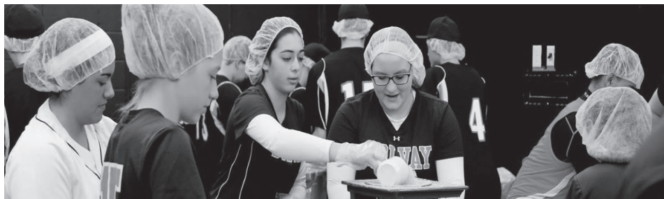
Athletes at the Feed My Starving Children event

Members of the junior varsity and varsity spring sport teams took part in the Feed My Starving Children (FMSC) event at the Syracuse Vineyard Church on April 14. FMSC is