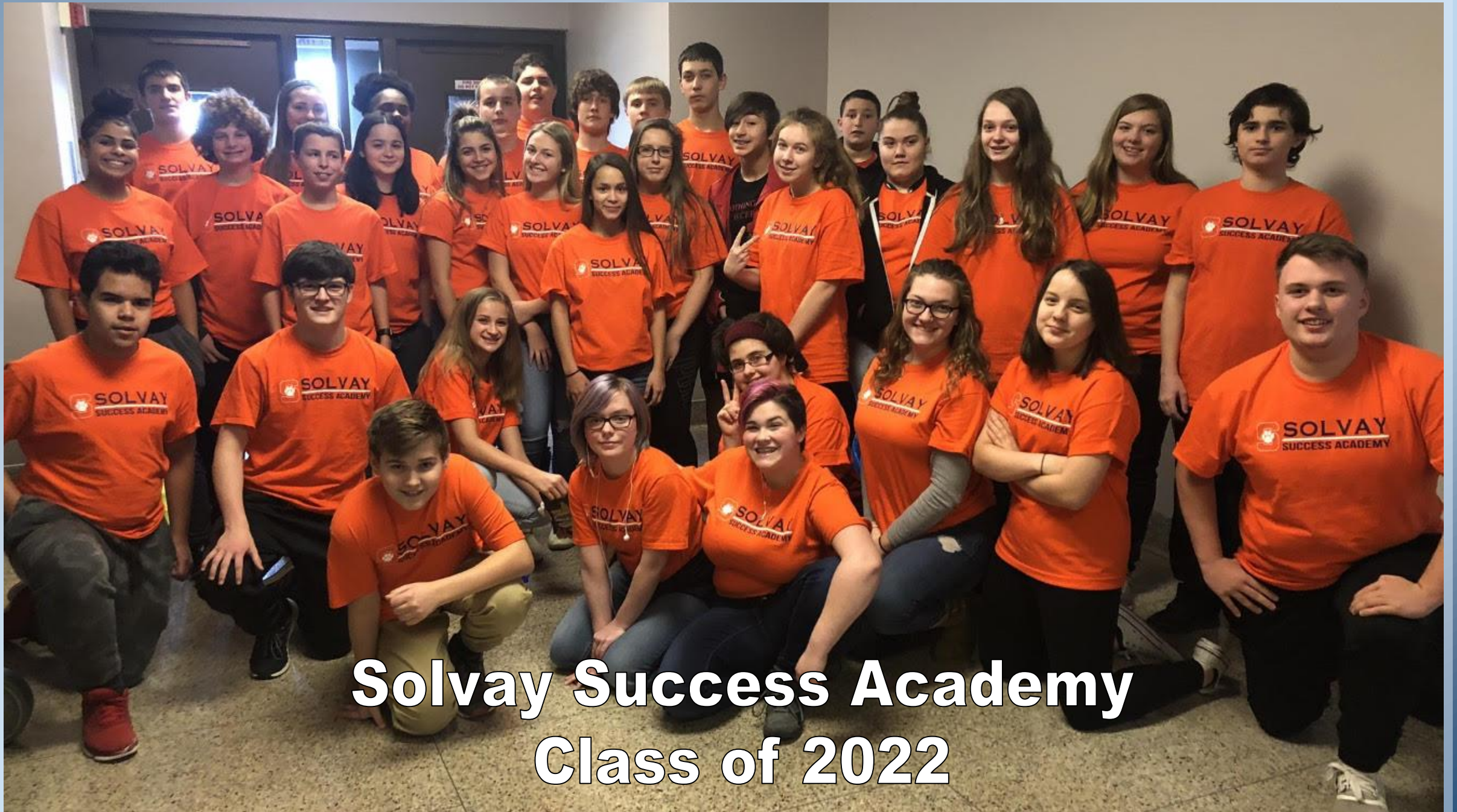
Solvay Success Academy Class of 2022