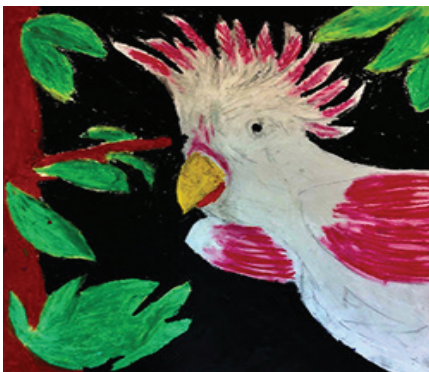
Kayko Weis, gr. 6