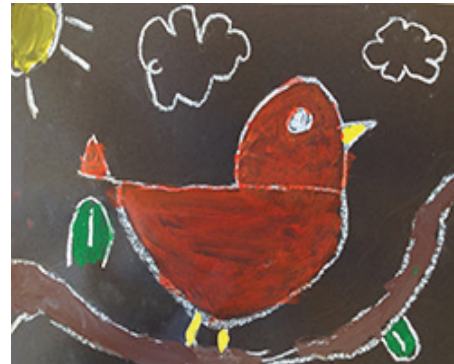
Harper Hollis, gr. 1