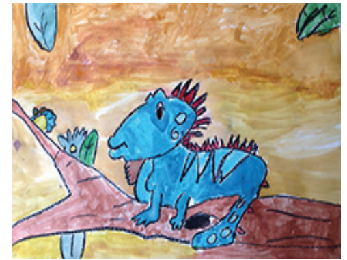
Isabella Claudio, gr. 4