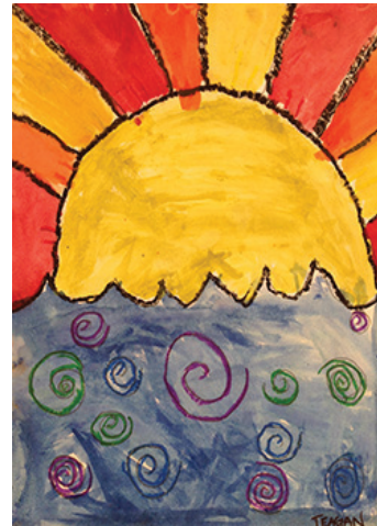
Teagan Carrigan, gr. 2