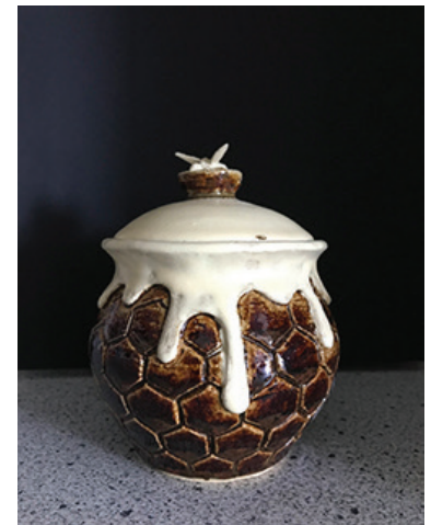
Vita Yatsyuk, gr. 12